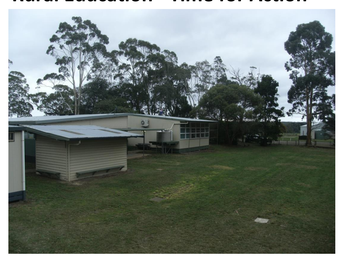
Glen Park Primary School