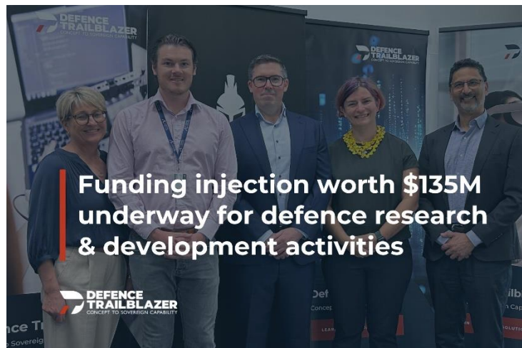
Pictured: The Defence Trailblazer team.

The Defence Trailblazer has had a strong start to 2025, with a total of $135 million worth of industry-led research and development projects now underway. This includes 35 industry-led projects with both Defence and cross-sector applications and 19 further projects in the pipeline. Many of these projects are led by Australian small-medium enterprises, reflecting strong support for Australia's innovation ecosystem. Read more about the Defence Trailblazer projects.